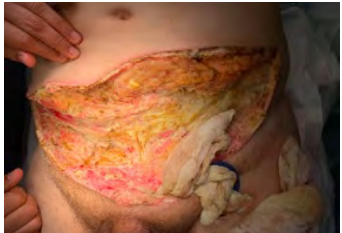
Figure 1 A transverse lower abdominal wall incision was made.

Upon discharge, the patient continued with oral antibiotic, and analgesic. The closed drain was withdrawn after 10 days, the surgical wound closed satisfactorily.