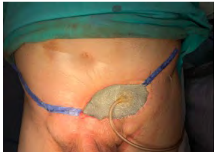
Figure 2A VAC on the left inguinal wound with extension to the scrotum through the inguinal canal.